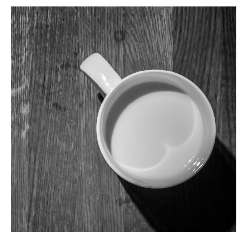
EUROPHOTOMATH 2017, 3º Premio_

Broken shadow, I took this picture with my phone. I set my chair up against the wall and pointed a light at it, this created the bigger shadow effect. I think it turned out really well.